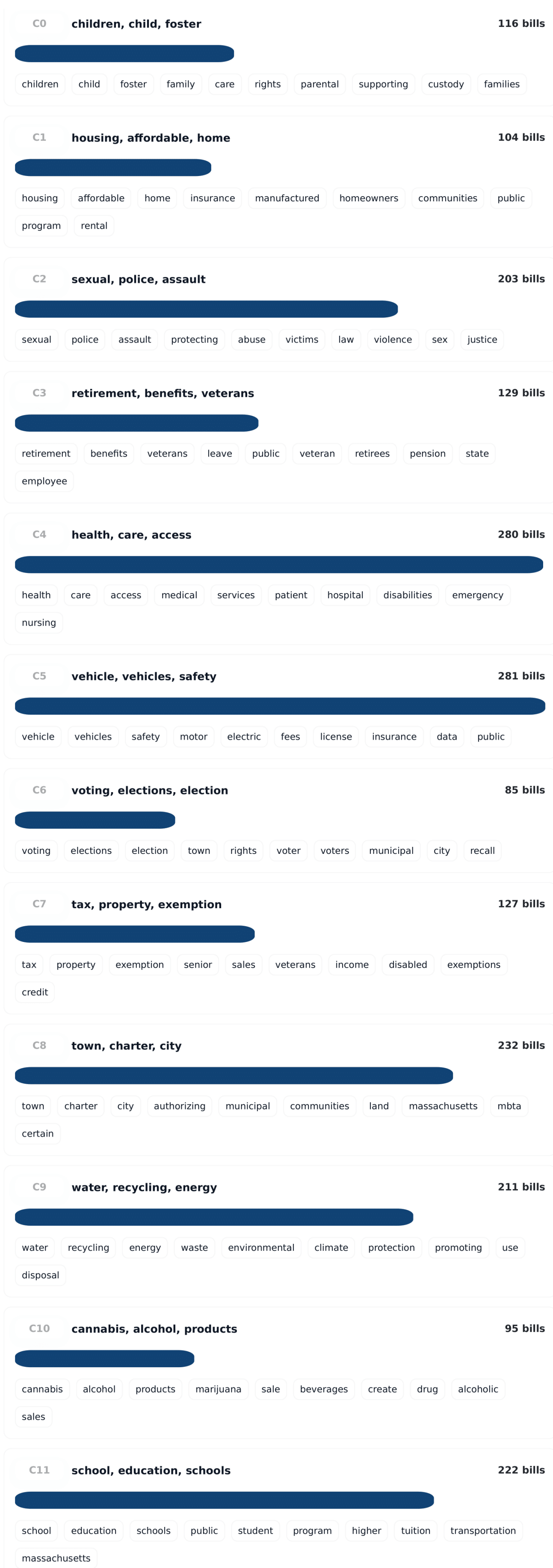
Figure 3: This graph sorts bills by subject matter, showing which categories are most impacted by missing vote tallies. "Other" mostly includes home rule petitions about charter amendments, local appointments, stipends, and other miscellaneous subjects.